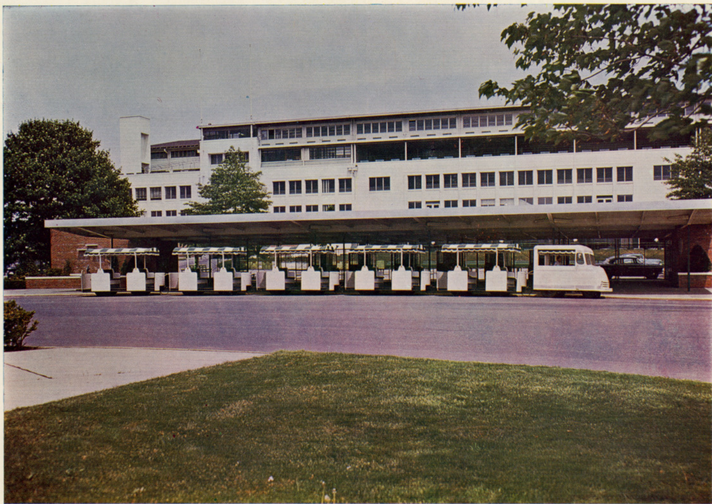
The Trackless/Train at Monmouth Park Jockey Club