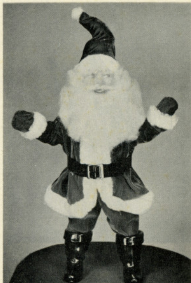
402-24" Stationary Santa Claus. Dressed in velveteen suit. In Red, White or Gold. (3½ lbs.)