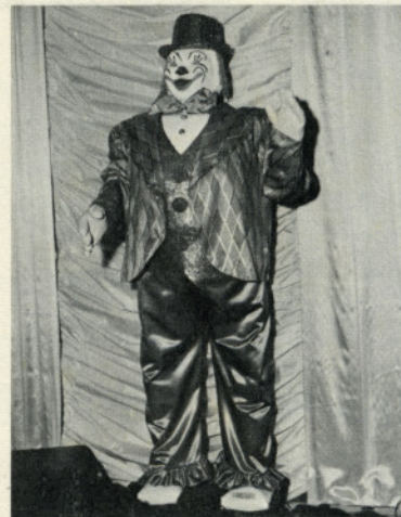
411-72" 50 lbs. Animated Clown. The right arm moves up and down, body swings side to side, costume made of heavy satin in vivid colors.