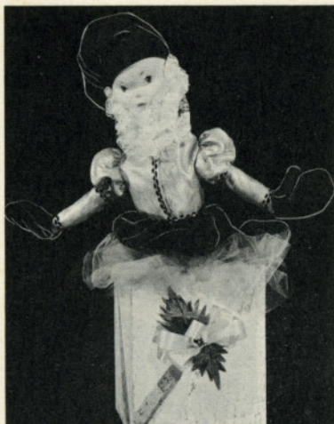
407-37" 18 lbs. Mechanical Gnomes. Sways from side to side in box, costumed in red velvet and gold metallic cloth.