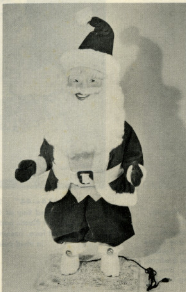
405-39" 18 lbs. Animated Santa Claus. Bending motion, arms move up and down. In red velvet and gold vest.