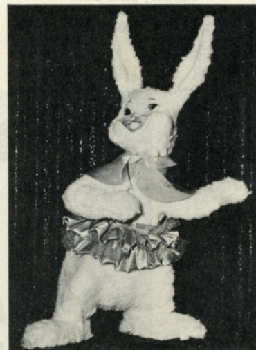
414-44" 22 lbs. Animated Boy or Girl Bunny. Made of Plastic and Fiberglass. Hand painted face, costumed of heavy satin in vivid colors.