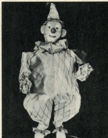
410-39" 18 lbs. Animated Clown. Bending motion arms move up and down, costume made of heavy satin in vivid colors.