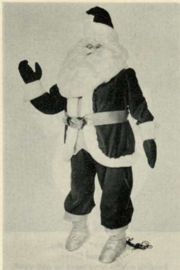
403-74" Animated Santa Claus 50 lbs. The right and left arm moves up and down. Body swings side to side. In red or white velvet, gold vest.