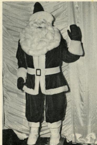
404-66" 45 lbs. Animated Santa Claus. The right arm moves up and down. Body swings side to side. In red or white velvet.