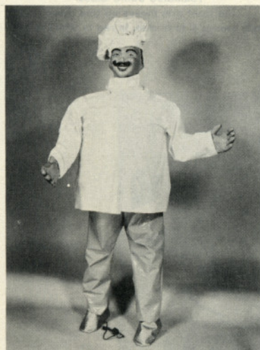
412-72" 50 lbs. Mechanical Chef. The right arm moves up and down left arm from side to side, body swings sideways, cos- tume suitable for indoors or outdoor use.