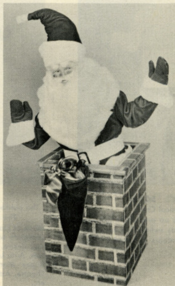
406-56" 30 lbs. Santa in Chimney. Body sways from side to side. In Red or White Velvet, Gold Vest.