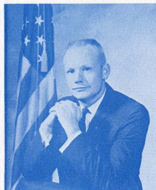
Neil A. Armstrong (Civilian), Commander; Born 5 August 1930; Married, 2 Children; B.S., Aeronautical Engineering, Purdue University; Graduate School, University of Southern California