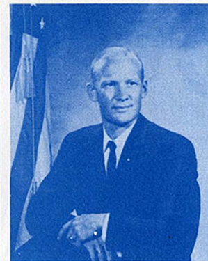
Edwin E. Aldrin, Jr. (Colonel, USAF) Lunar Module Pilot; Born 20 January 1930; Married, 3 Children; B.S., U.S. Military Academy at West Point; Doctor of Science, Astronautics, Massa- chusetts Institute of Technology