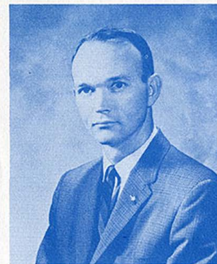
Michael Collins (Lieutenant Colonel, USAF) Command Module Pilot; Born 31 October 1930; Married, 3 Children; B.S., U.S. Military Academy at West Point