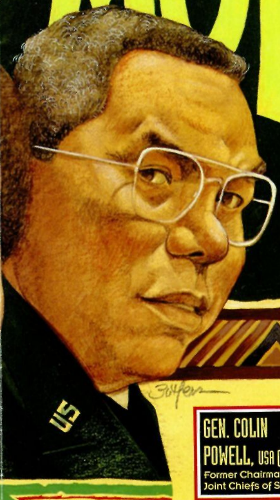
GEN. COLIN POWELL, USA (RET.) Former Chairman, Joint Chiefs of Staff