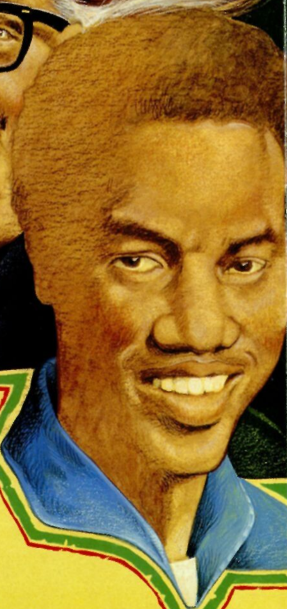
COL. GUION S. BLUFORD JR., USAF (RET.) Former Astronaut