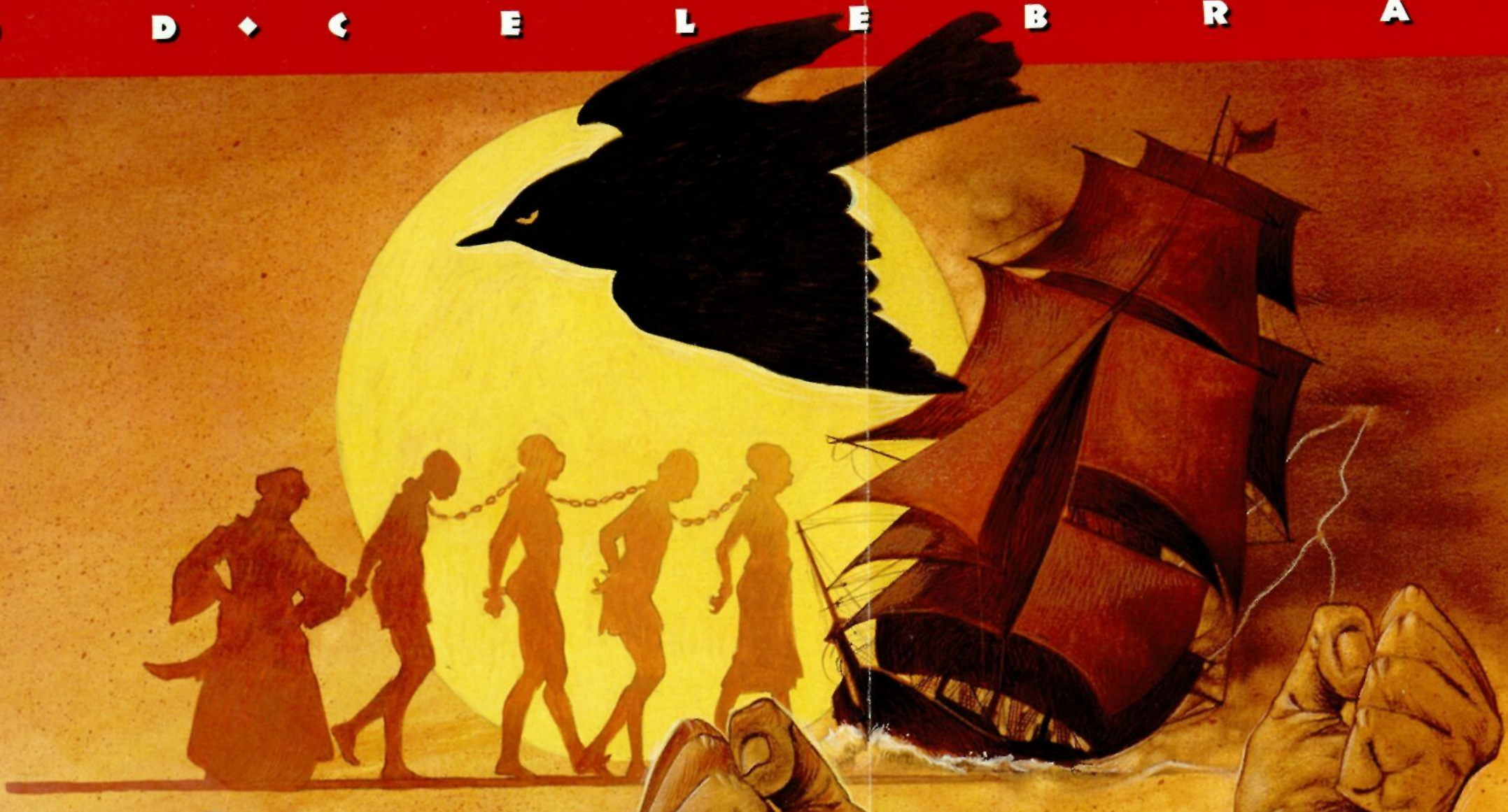
FREDERICK DOUGLASS Abolitionist