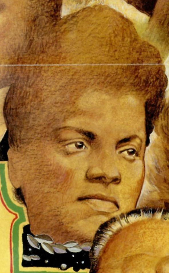
IDA WELLS Journalist, Teacher, Civil Rights Leader