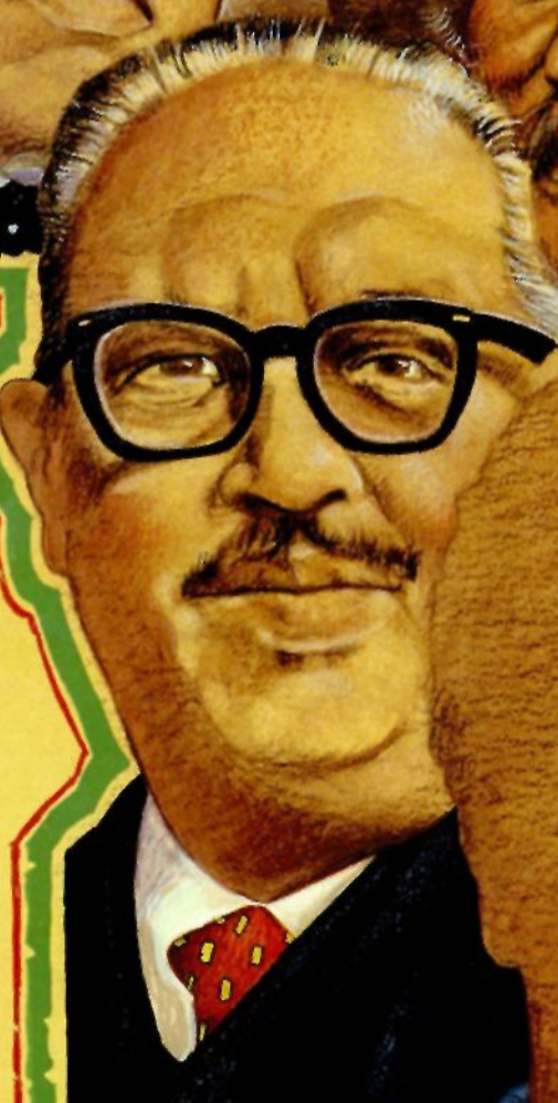
THURGOOD MARSHALL Supreme Court Justice