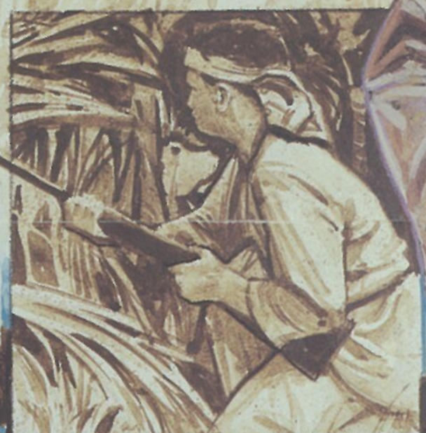
INDOCHINA (July 1943) — Indochinese guerrillas continue to supply valuable intelligence and information about Allied POWs while conducting occasional raids on the Japanese occupation forces.