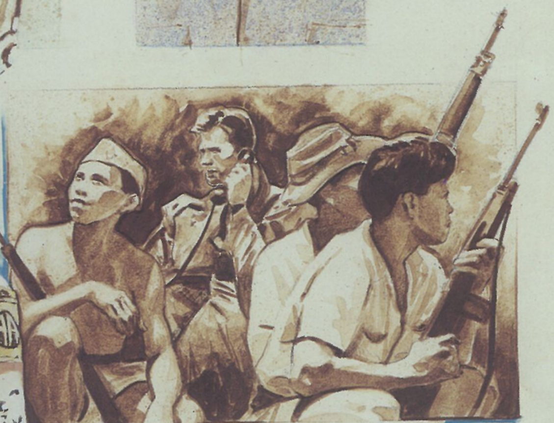
Negros, The Philippines (March 29, 1945) — U.S. troops landed on this central Philippine island today and were joined in battle by an estimated 14,000 Filipino guerrillas who had been harassing the Japanese and radioing intelligence to the Allies since the fall of the Philippines in 1942.