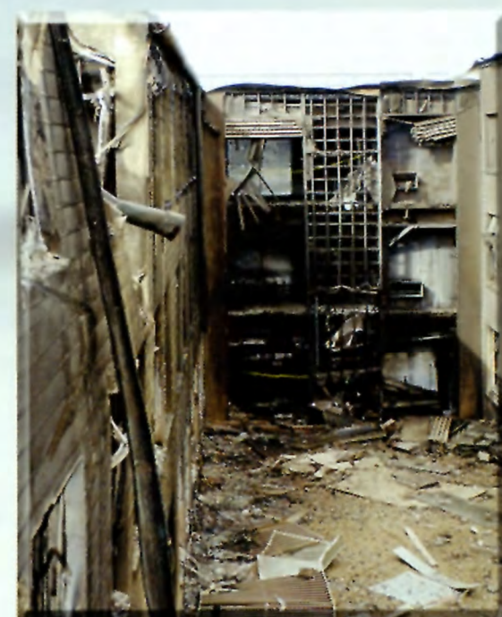
Debris inside the Impact Zone (1st floor; E Ring).