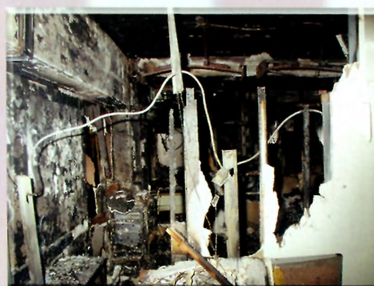
The remains of an office, including copy machine, in the impact area.