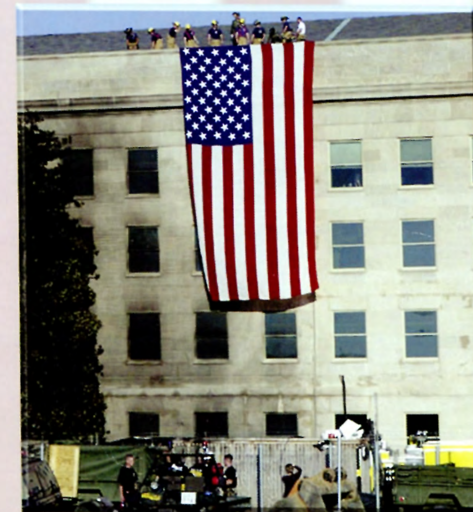
God Bless America!