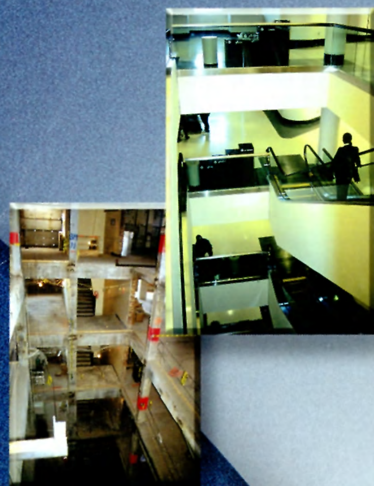
Floor slabs were removed to clear the way for new and convenient escalator banks.