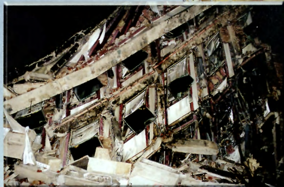
Collapsed portion of Wedge One showing the blast-resistant windows and steel frames still in place. Fire damaged the wooden roof and limestone facade. Replacement limestone will come from the same quarry in Indiana as the original stone.