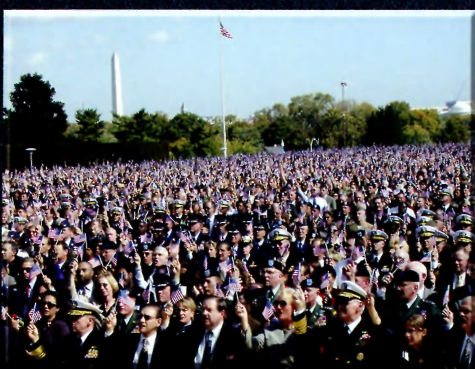
The Pentagon October 11, 2001 United in memory