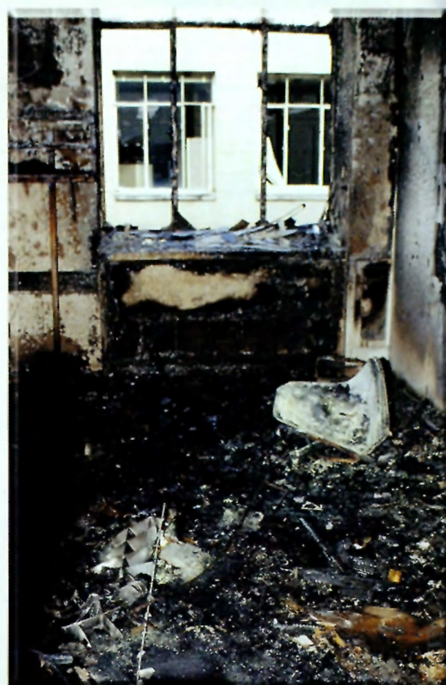
Damage inside an E Ring office without blast-resistant windows and other security designs was far greater.