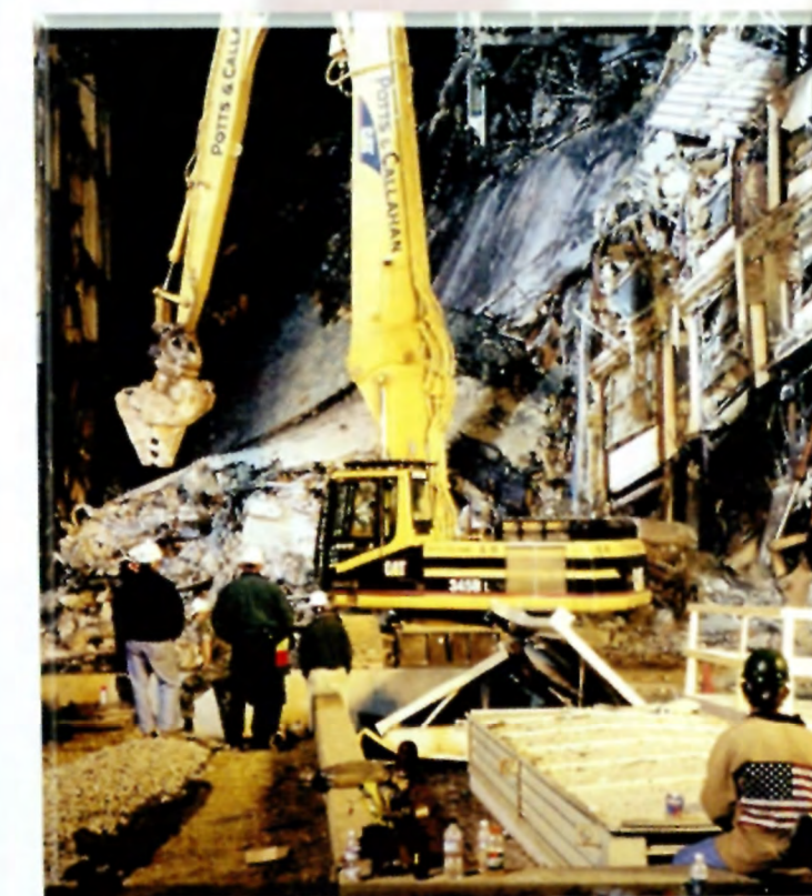
Collapsed section at the Pentagon - it held for up to 30 minutes after the attack because of security designs.