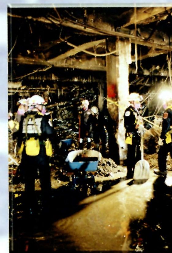
Water and fire damage inside the Impact Zone.