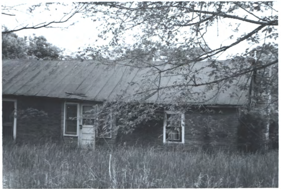
| dogtrot |