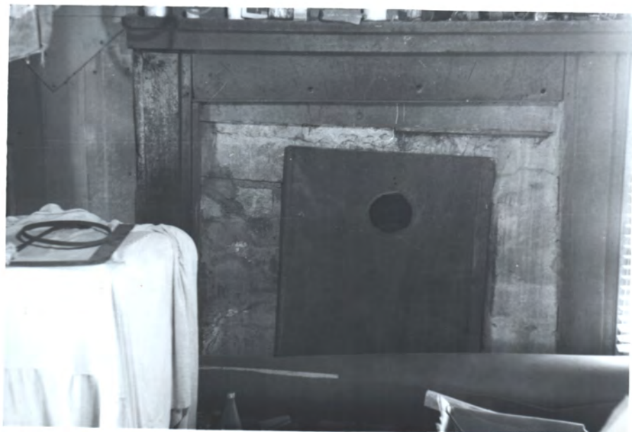
"HALL" mantel (only one in hall)