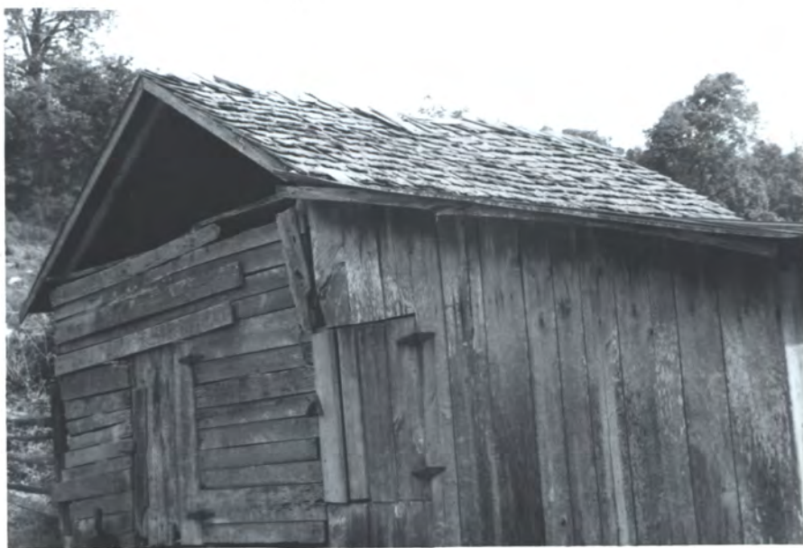
Shed, N.W.M. elderly owner in 1978 says he split these roof shingles when a kid, using a froe (tool)