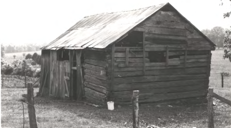
log barn, N. wall of yard