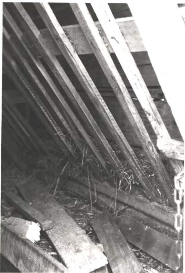
Manger \pm 18^{\circ} w. x 6' d.