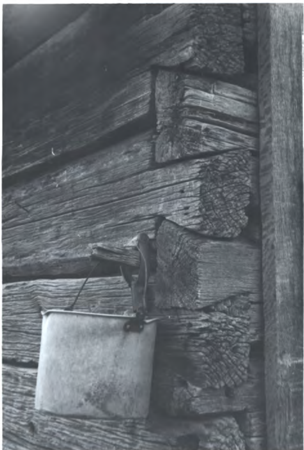
Barn, N.E. corner