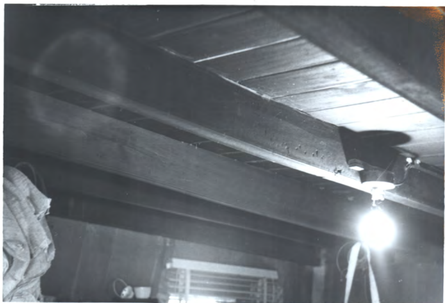
banded - edge planed joints \pm 2' o.c. fl. / ceiling.