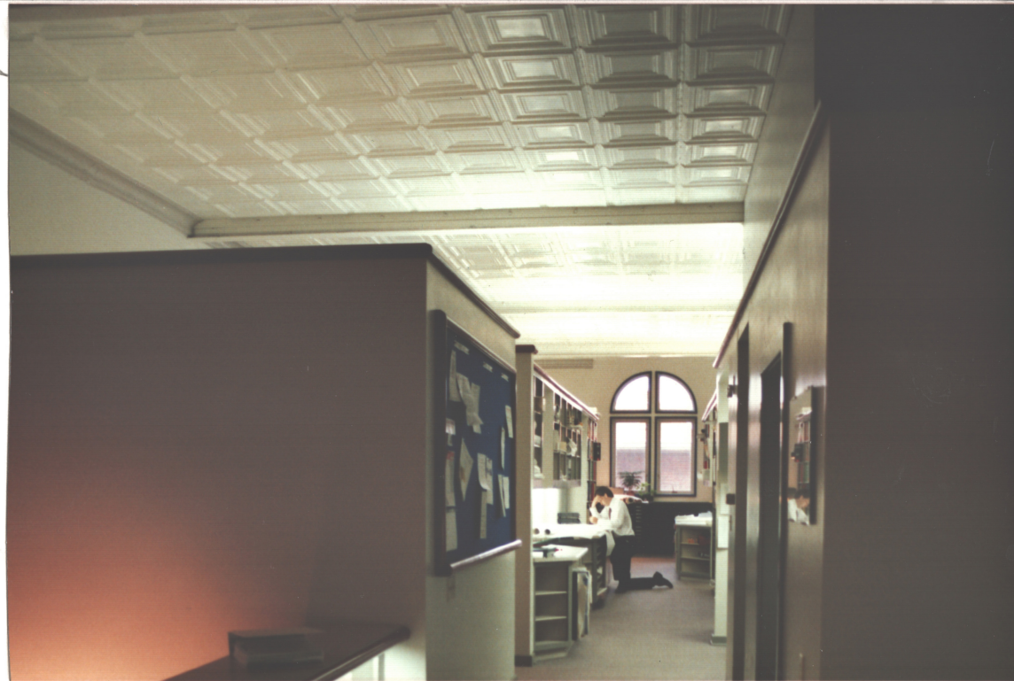
HJ Central aisle