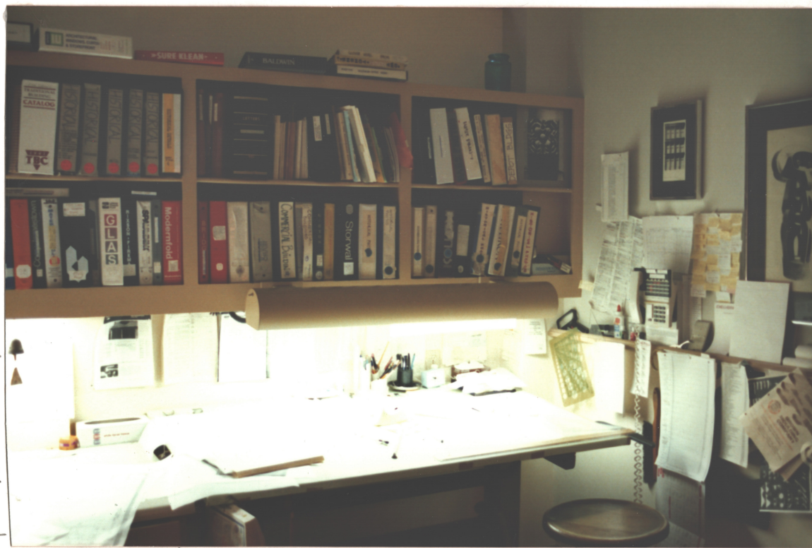
1955 drumming table, $35 new. 1946 stool, was discarded