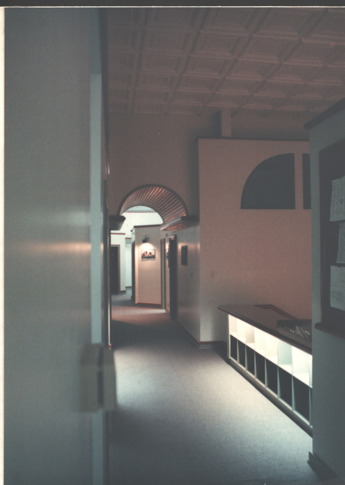
N-H Central area