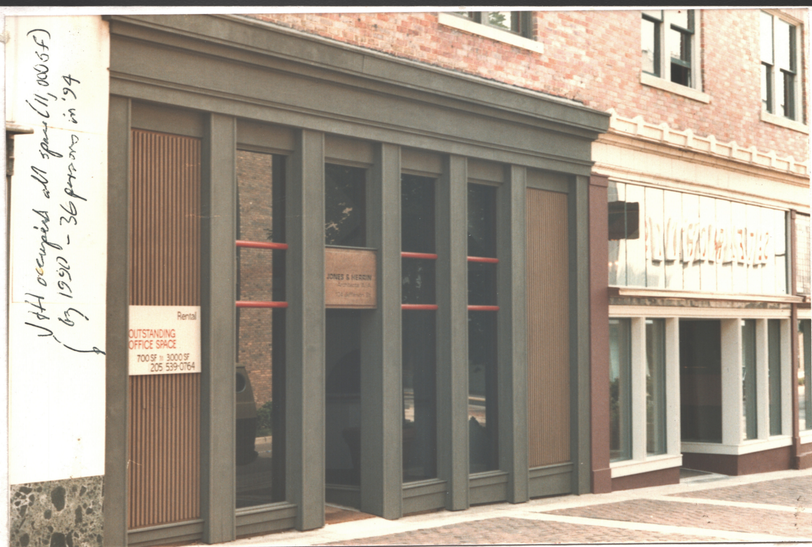
104 Jeff. St. in c. 1986