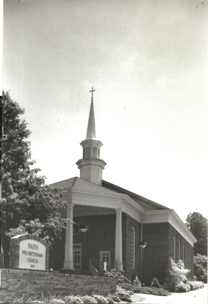
#4. Fellowship H&M - c.1990