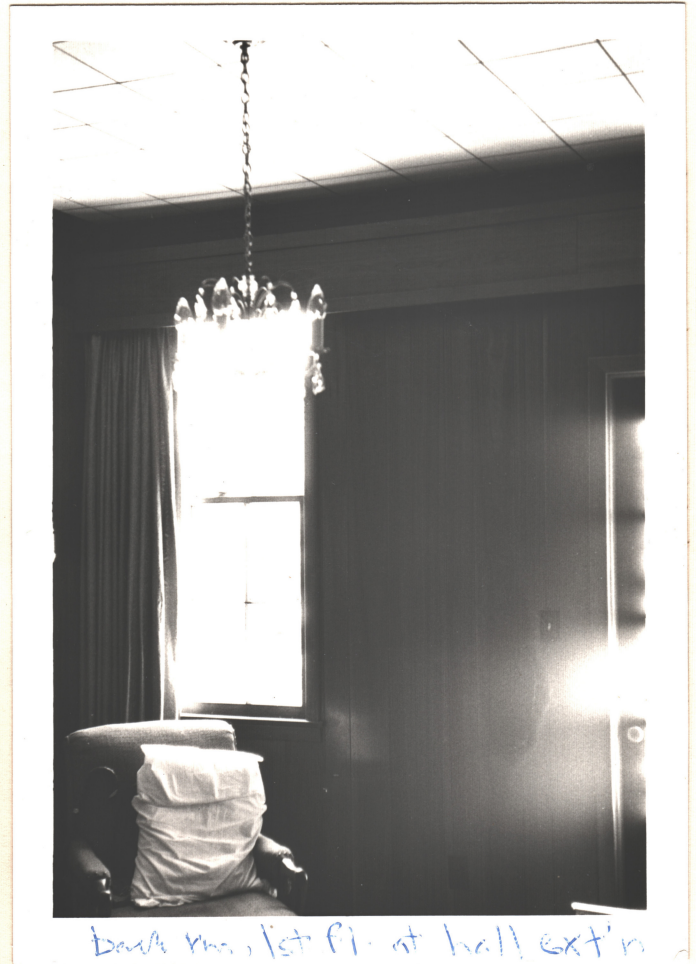
back rm, 1st fl. at hall ext'n