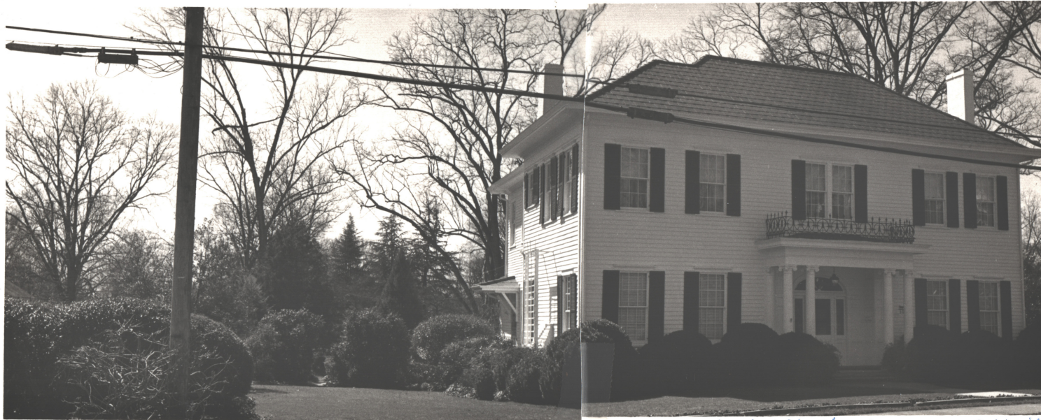
604 ADAMS ST. MAR 18-81