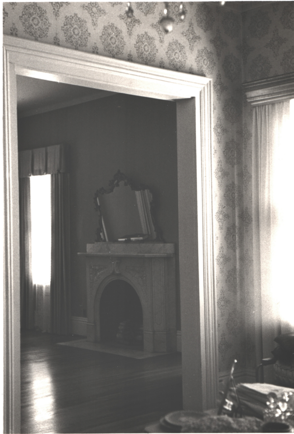
DK, look into SE Parlor