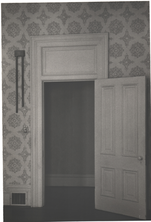
D.R. door to hall