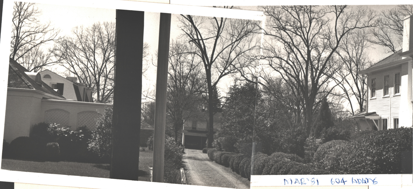
MAR '81 604 ADAMS