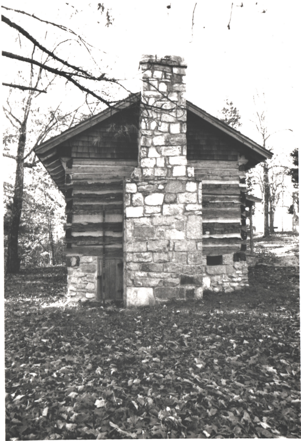
Chim. not per 1840 details