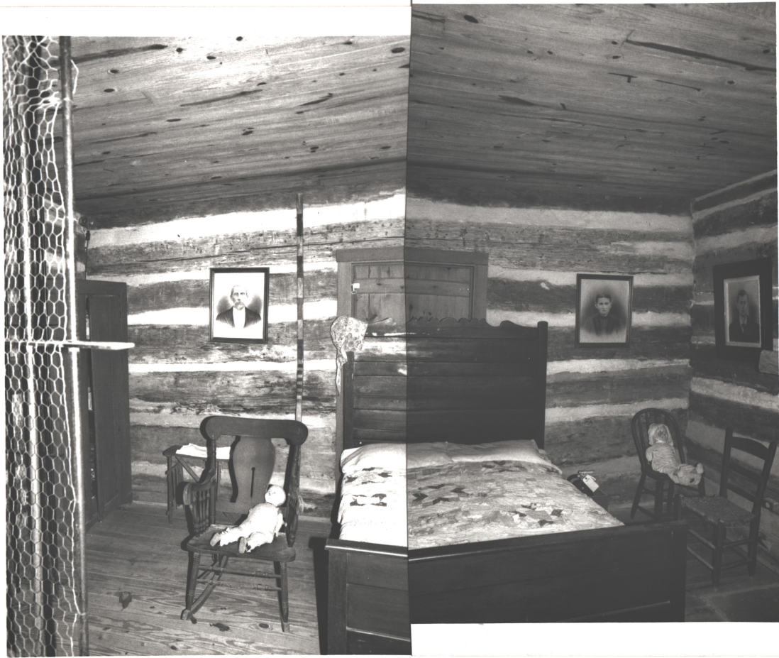
West Room NW