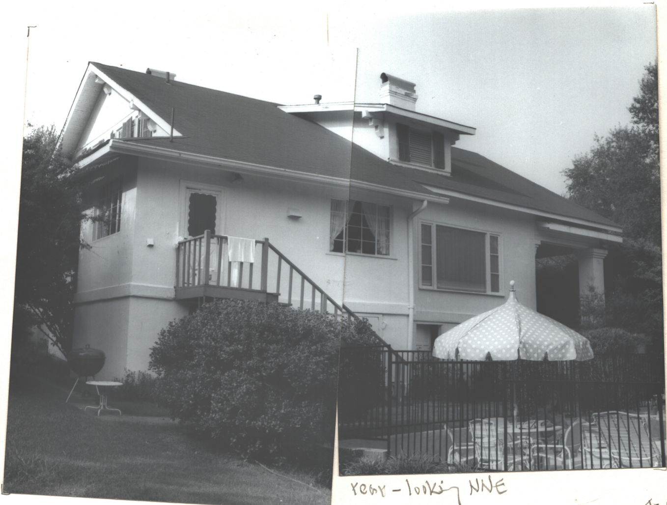
rear - looking NNE