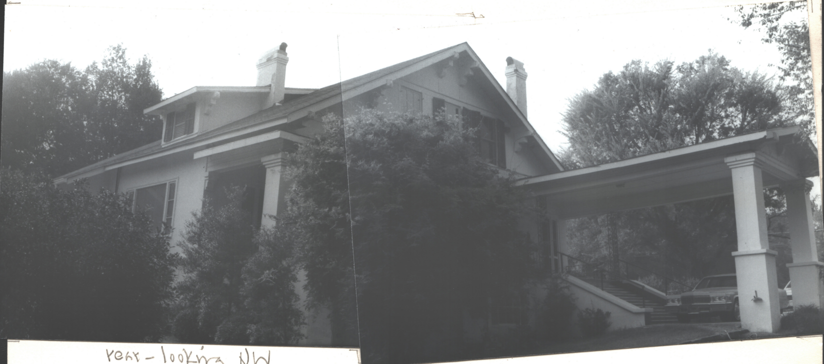
rear - looking NW