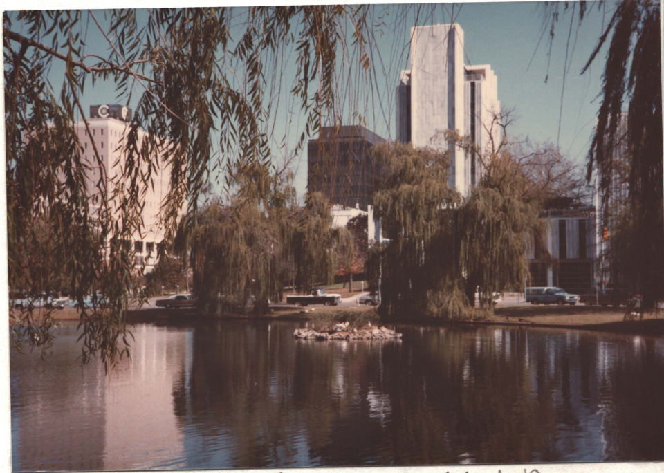
July '61 City Hall