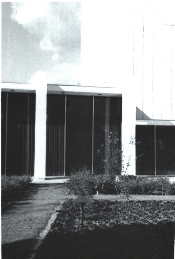
Council 12 AM