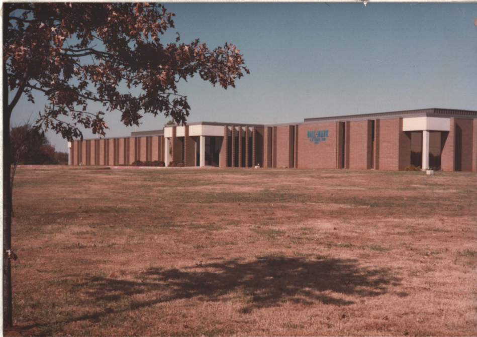
c. 1976 U.D.S. Bldg. - HJ