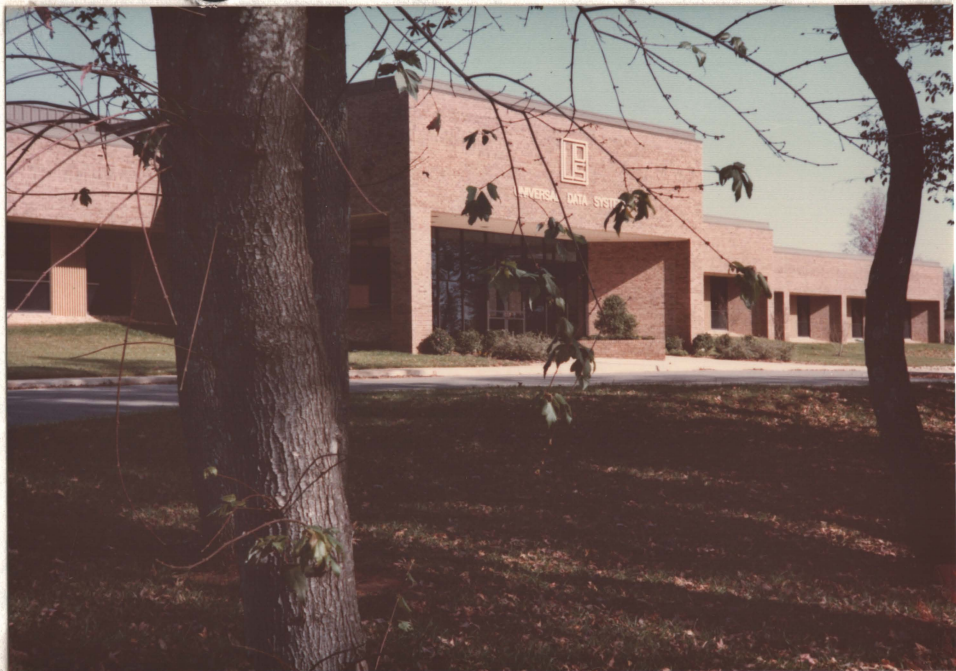
c. 1979 (1981 Bldg. in rear) Universal Data Systems (later "Motorola UDS")