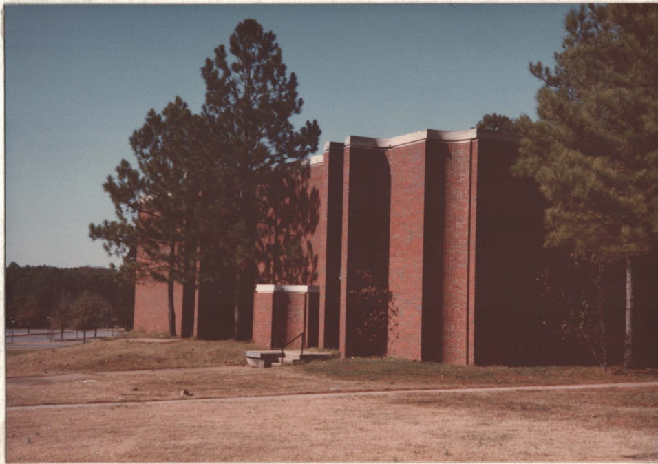
c. 1969 VAA INTERIM UNION - HJ (erected in c. 1986 by a largely by JPP ARMs)

VAA UNION & BD. OF REALTORS UDS MOTOROLA POLYDAN RES