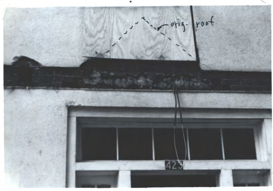
orig. 1850's + ADDN, 1850-1850's MID-1850's