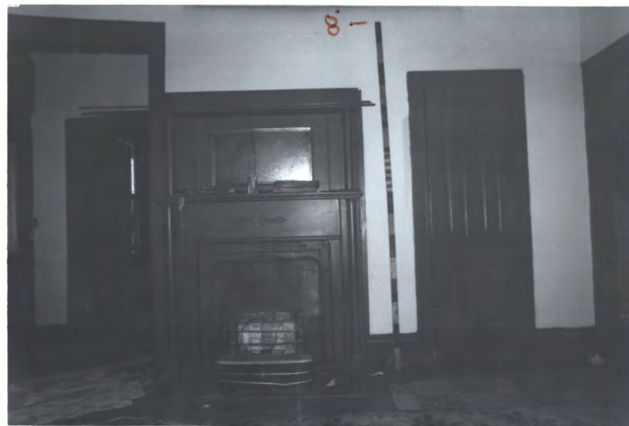
FL. 1 - N. W. RM.