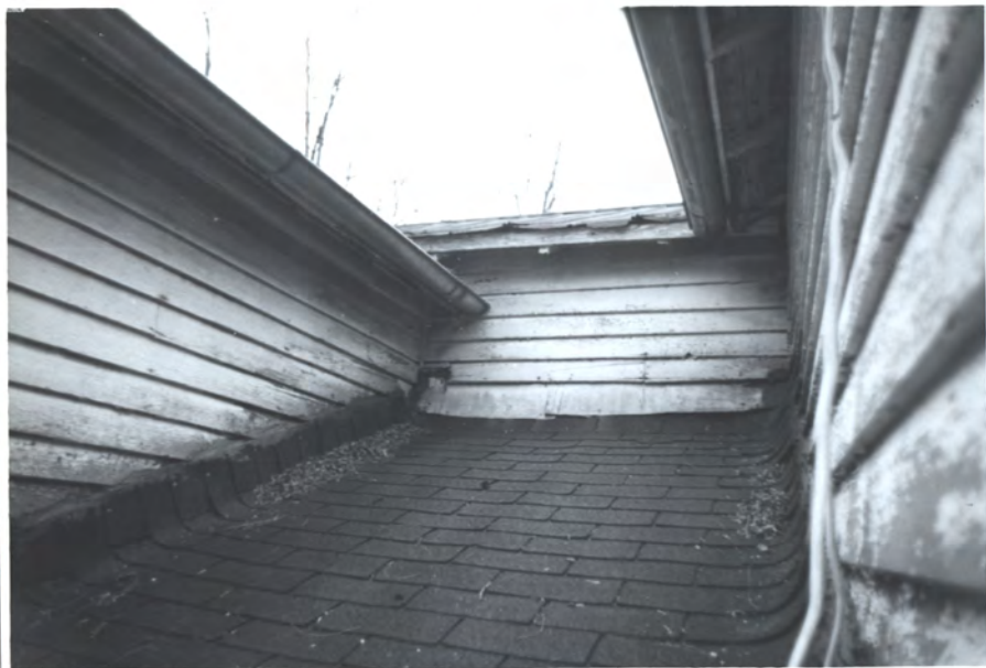
S. REAR CHIM. ROOF