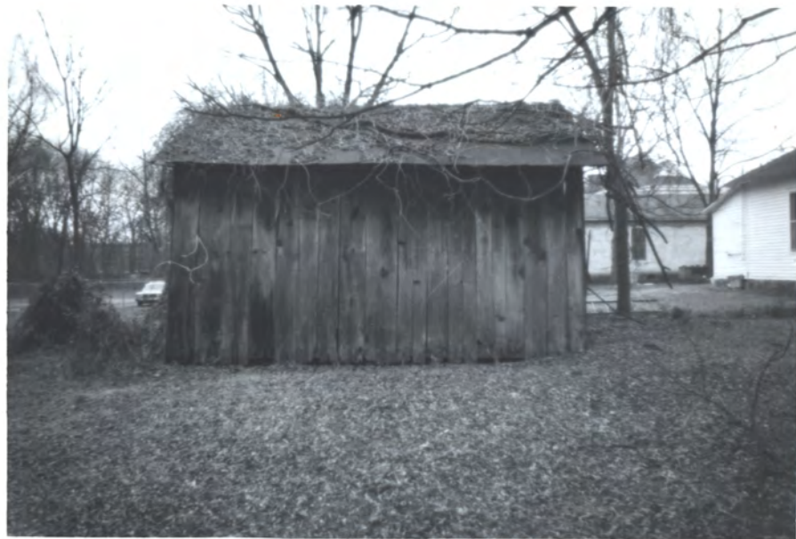
← STOR. SHED (+ buggy hse?) → N