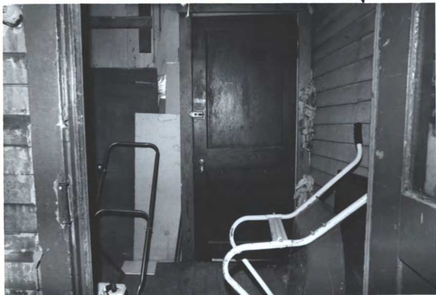
BLACK PORCH ↓ N

cut in clapboards for window at S.W. Rm., E. wall