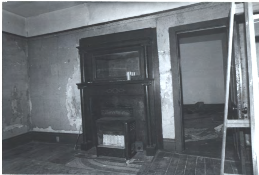
FL. 1 N. E. RM.