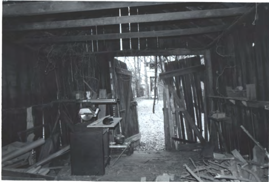
↖ N. WALL