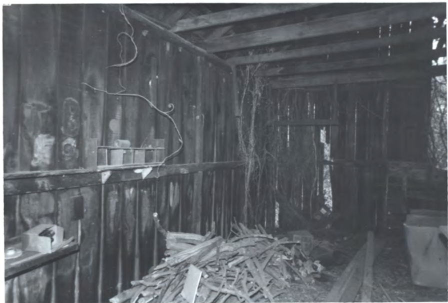
W → E. WALL