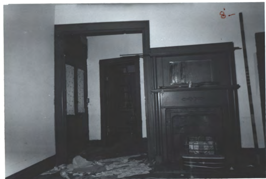
FL. 1 - N. W. RM.