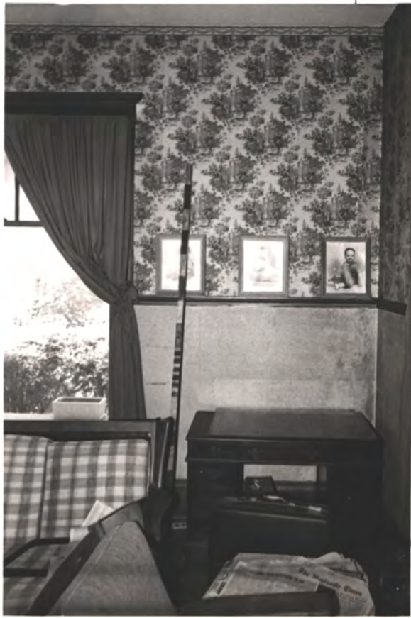
STUDY - FINE PH