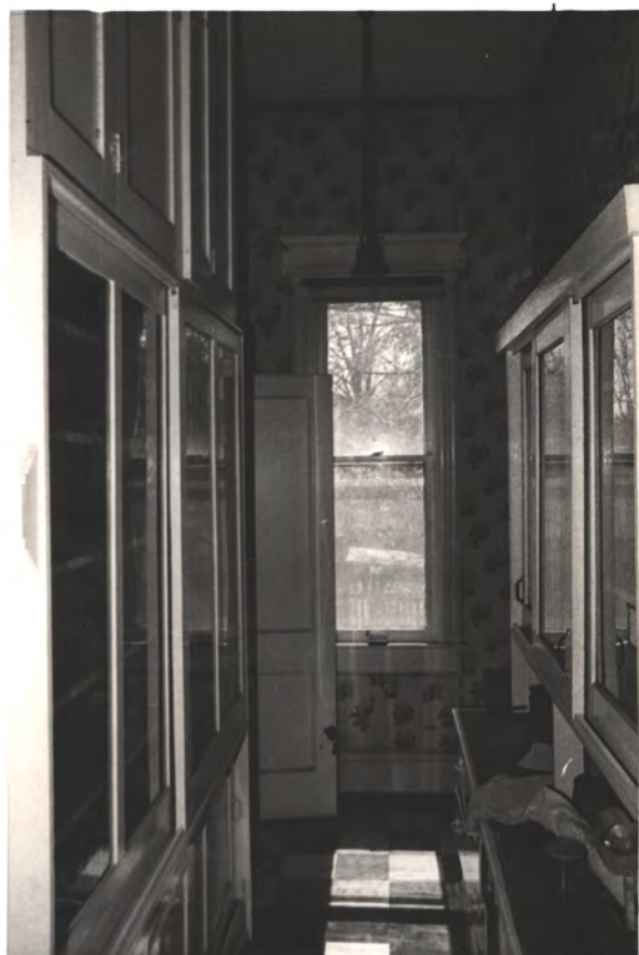
PL. I S.W. PH 109