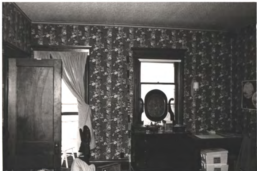
FL. 2 - N.W. B.R.