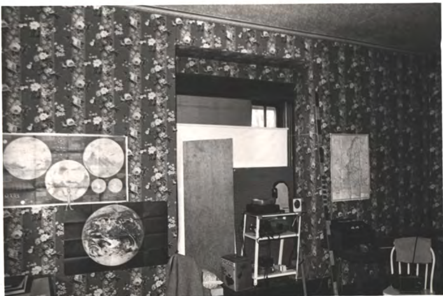
FL. 2 - N.W. B.R.