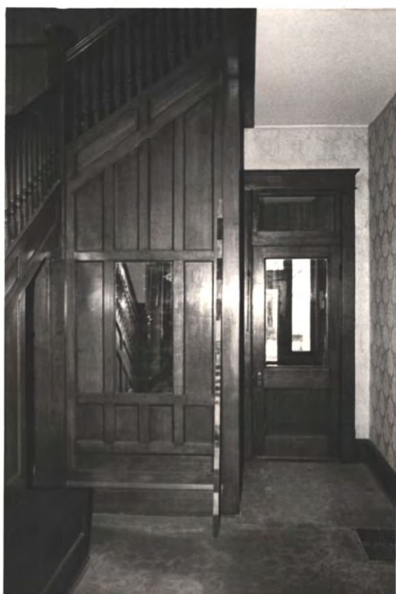
PL. I SW 112