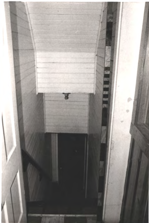
ESMNT STAIR ←