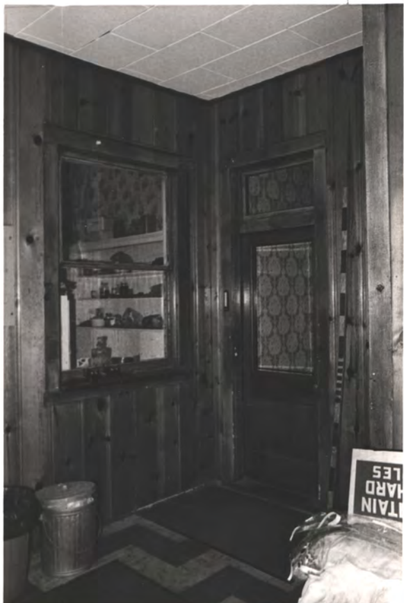
FL. 1 ENCLOS. PORCH →