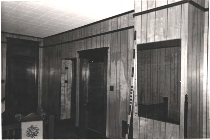
FL. 2 HALL → N