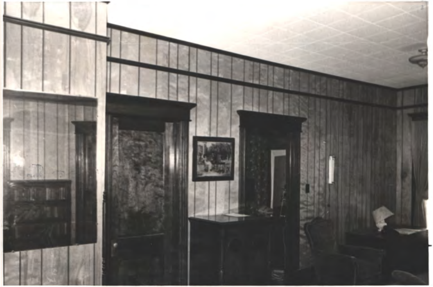
FL. 2 HALL