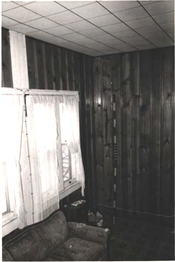
FL. 2 ENCLOS. S. E. PORCH