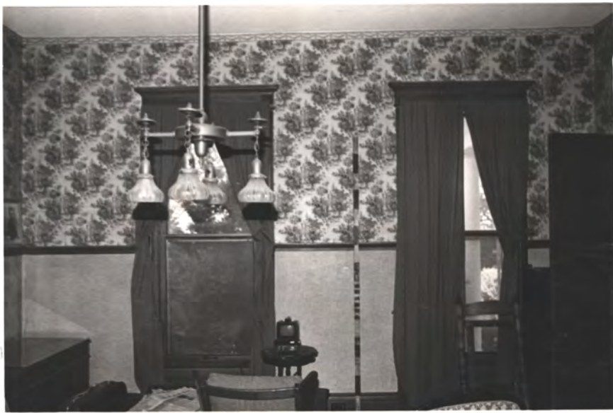
W4 Study - FINE,