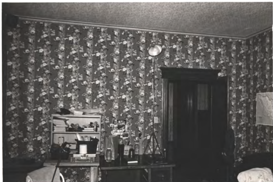
FL. 2 - N.W. B.R.