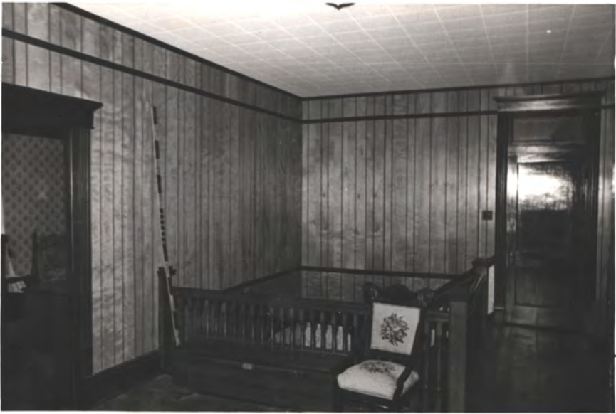
FL. 2 HALL