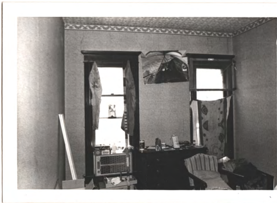
Fl. 2 S.W. B.R.