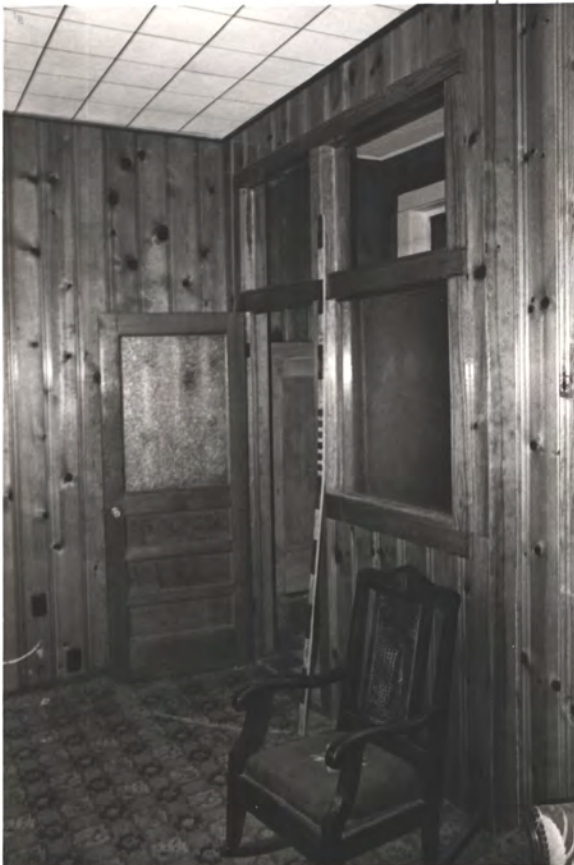
FL. 2 ENCLOS. S.E. ROCK