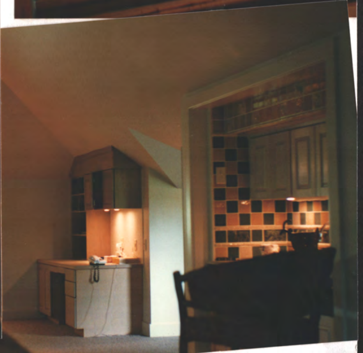
DEVELOPED KITCHEN RM - LOOK EAST