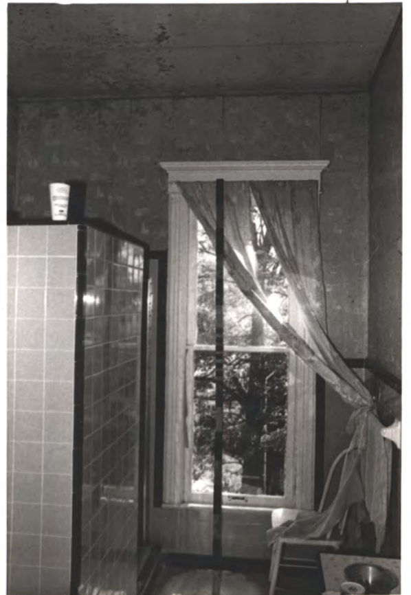
FL. 2 W. BATH