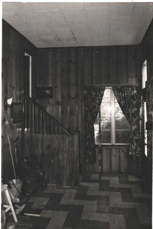
FL. 1 ENCLOS. S.E. PORCH