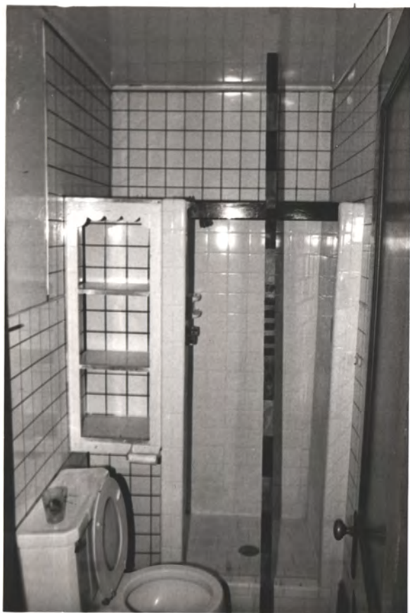
Fl. 2 EAST BATH