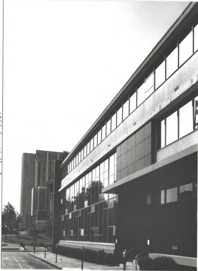
1964 City Hall

Huntsville Utilities Bldg. - 1955 Turner & Northington, Avn. - Florence, AL (later Northington, Smith & Kernett)