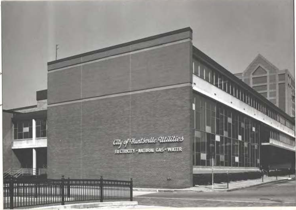
HILLS UTIL. 1955