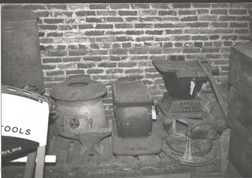
Cast-iron coal-stoves Early to mid 20th cent.