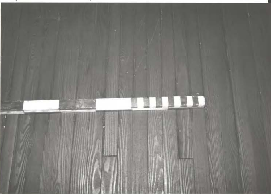
Oiled pine fl., 7' 6" N →