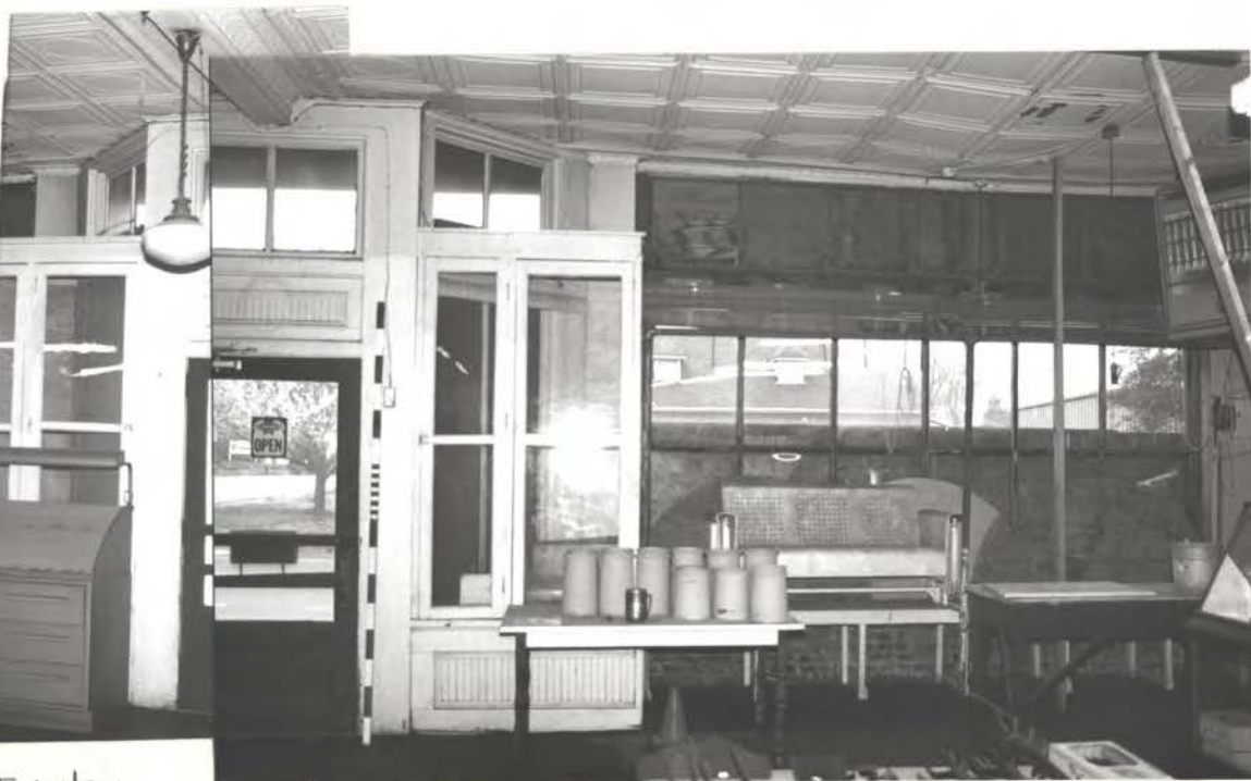
E. Front entry