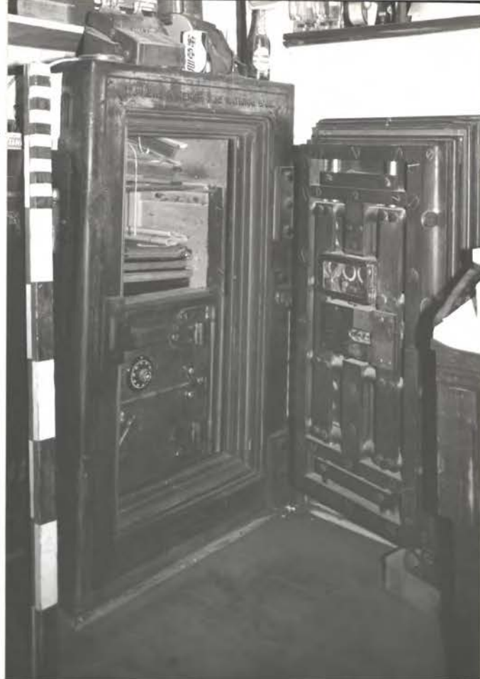
2 safes at N. wall. Rt. safe still has elaborate pin-stripes paint decoration. Rt. safe reportedly was originally in a bank in the 1896 Humbley Bldg. at the east end of the S. side of the Ct. Hse Sq.