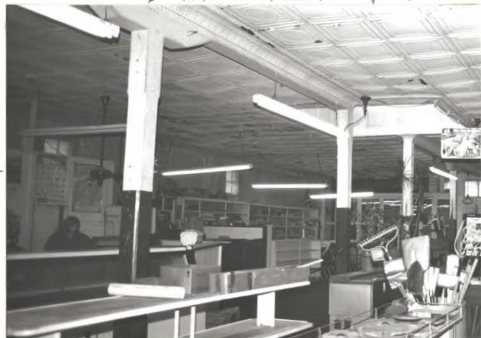
Orig. Dept. (N. camp)