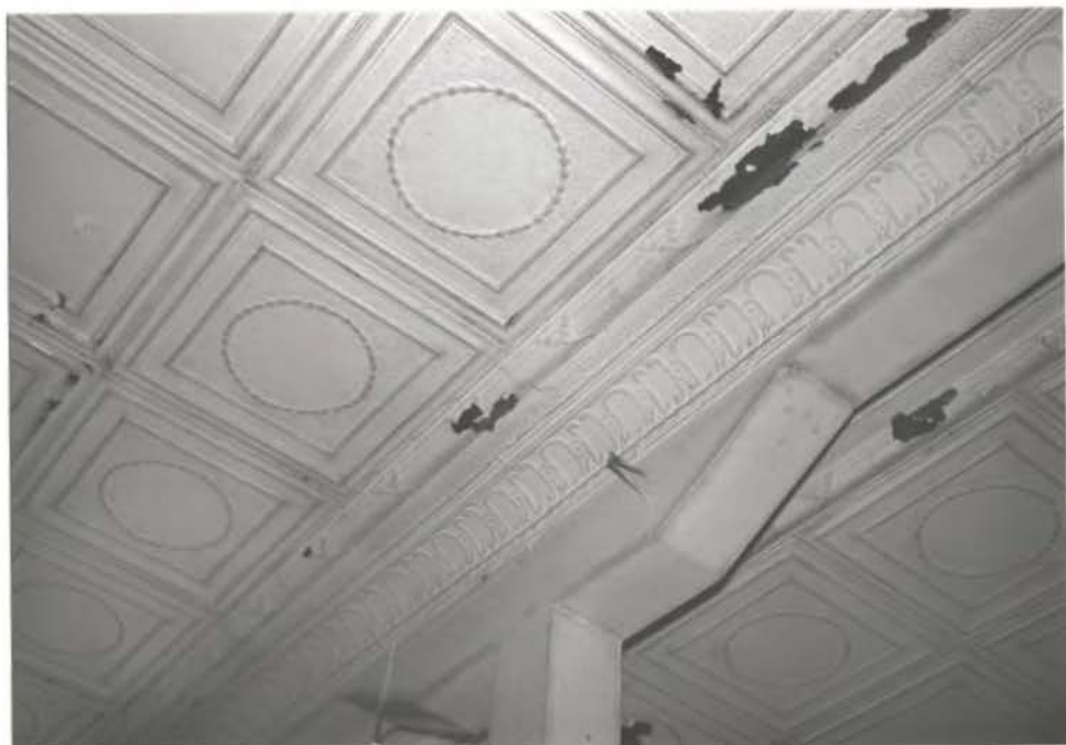
Stamped metal cell. & cornice timber col. & beam