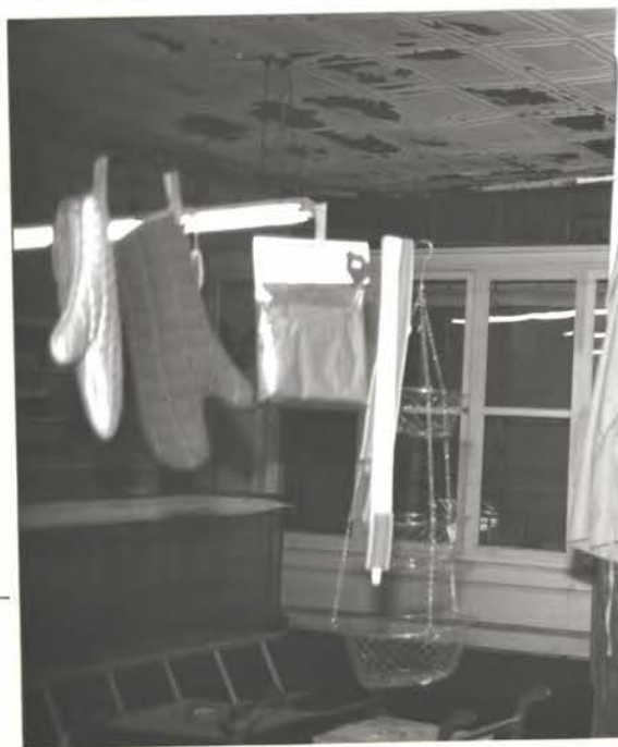
E. Grocery Dept