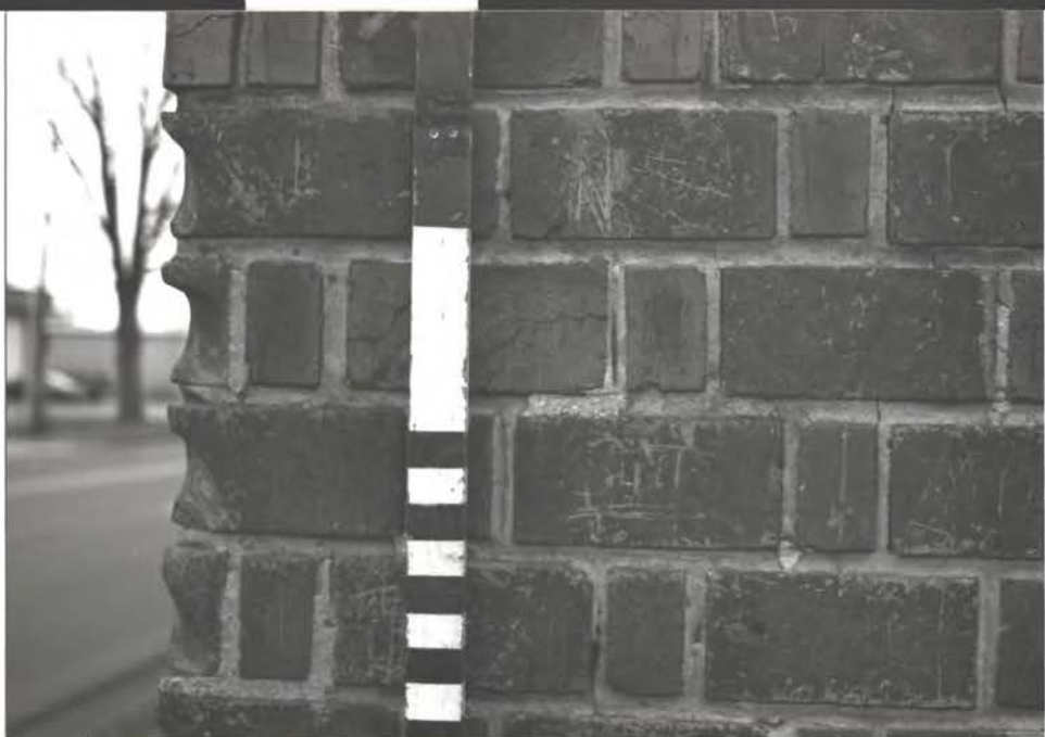
Perhaps loiterers would sharpen their pocketknives on the brick corners E. N.E. Corner