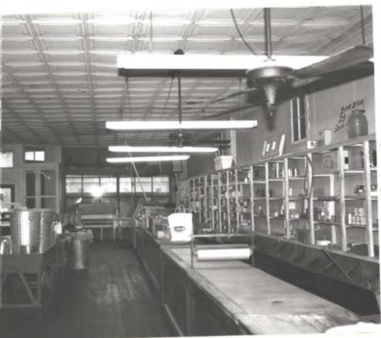
Gen'l Mds (S. camp)