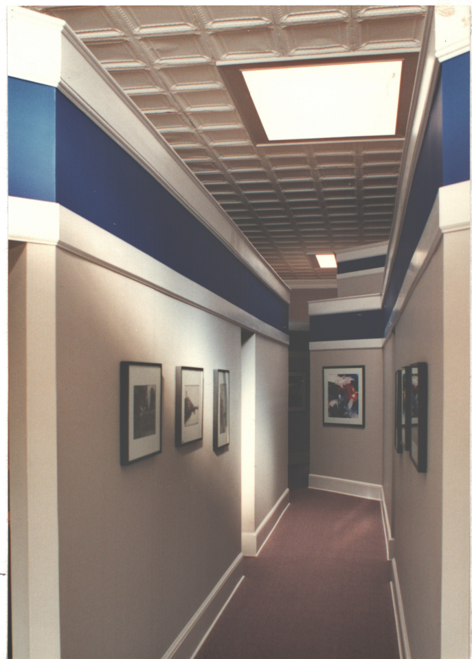
c. 1915-20 Bldg., Marion St., Athens Al. remov. 1993 for Pepper Annex. - Jans & Herrin Arch.