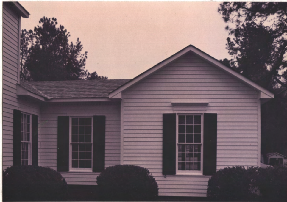
W. Wing (was built as gar., now a sitting rm.)