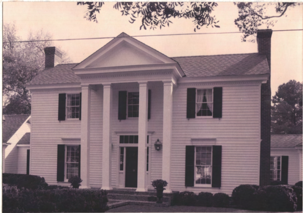
photo Oct '97 AFTER PROPORTIONAL REFINEMENTS by J.H. Arch HP Jones (See "before" photos of April '96)