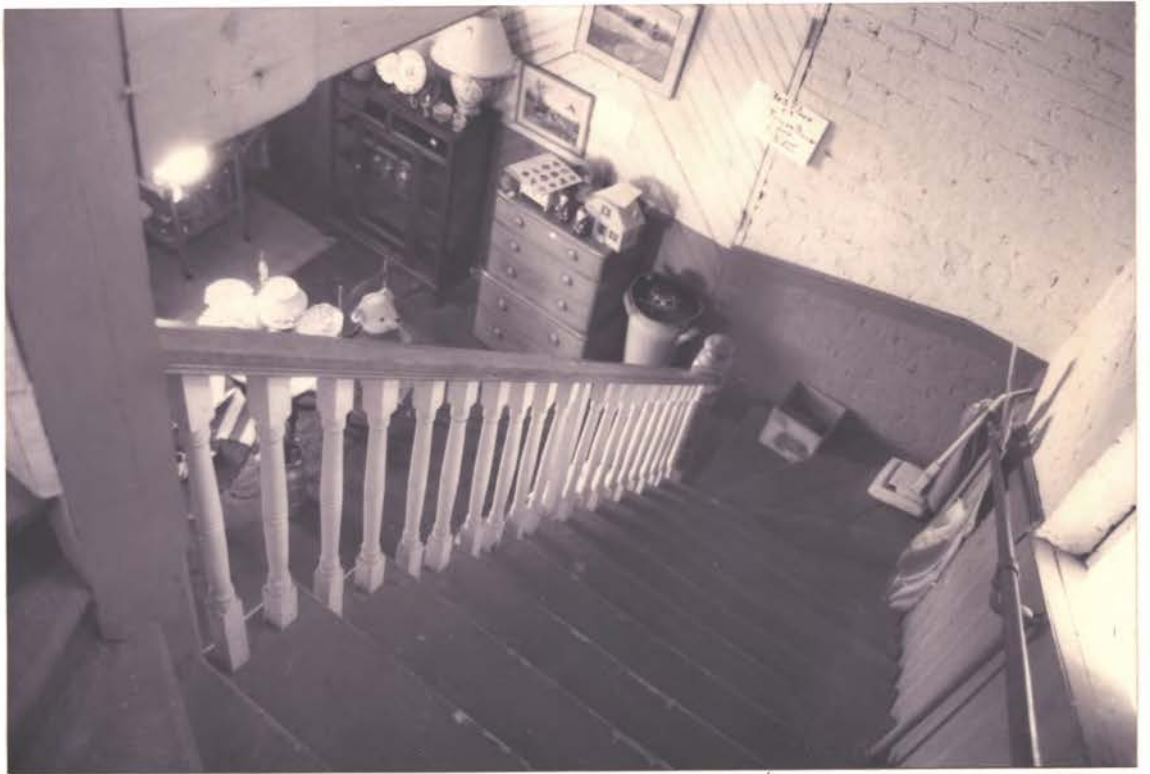
Tower stair (orig.)