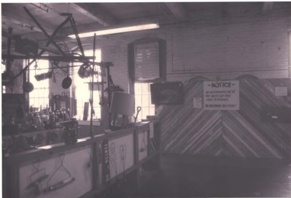
Fl. 1(?) in mill