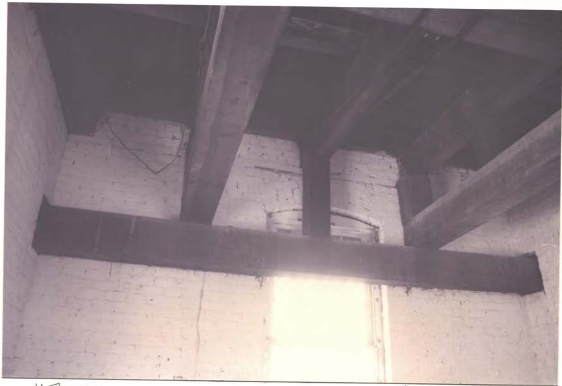
Tower, fl. 2

heavy timber to support water tank above in top of tower