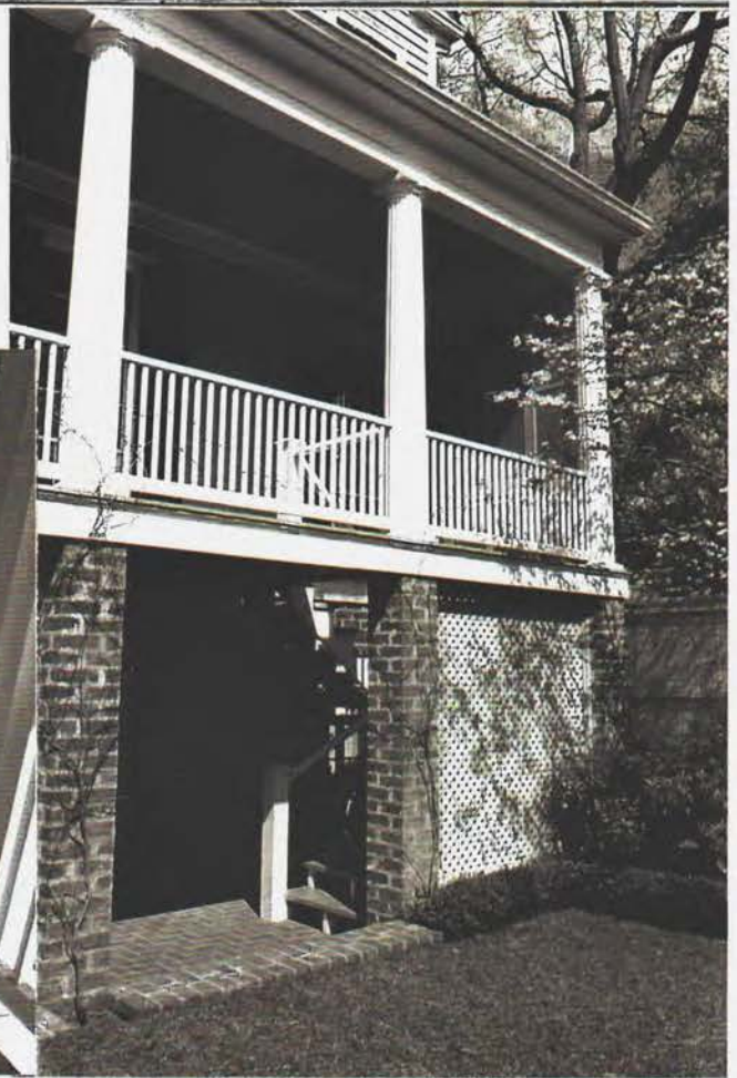
"before" (1970's stair)