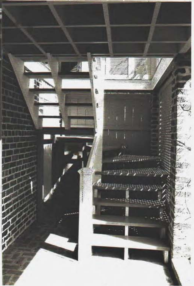
~ 1970's stair on side Verbonden

M/M's house also (1850's?) ← same as this