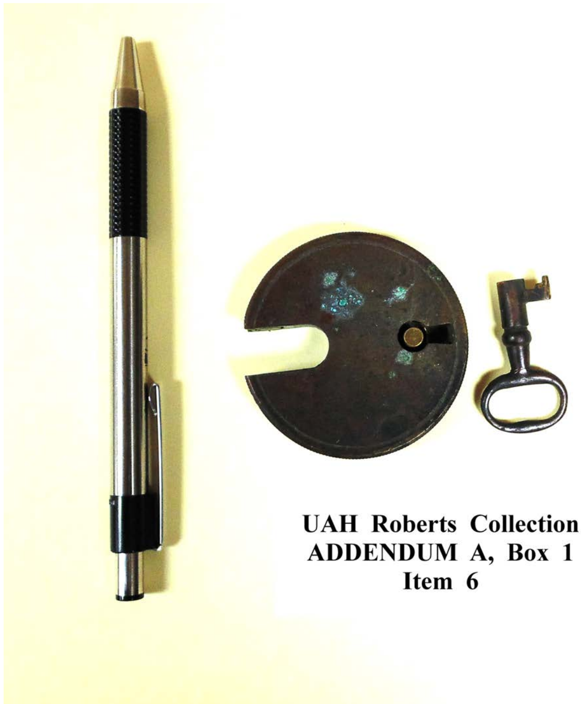
UAH Roberts Collection ADDENDUM A, Box 1 Item 6

Image 2 r13_01-00-006-4887 Contents Index About