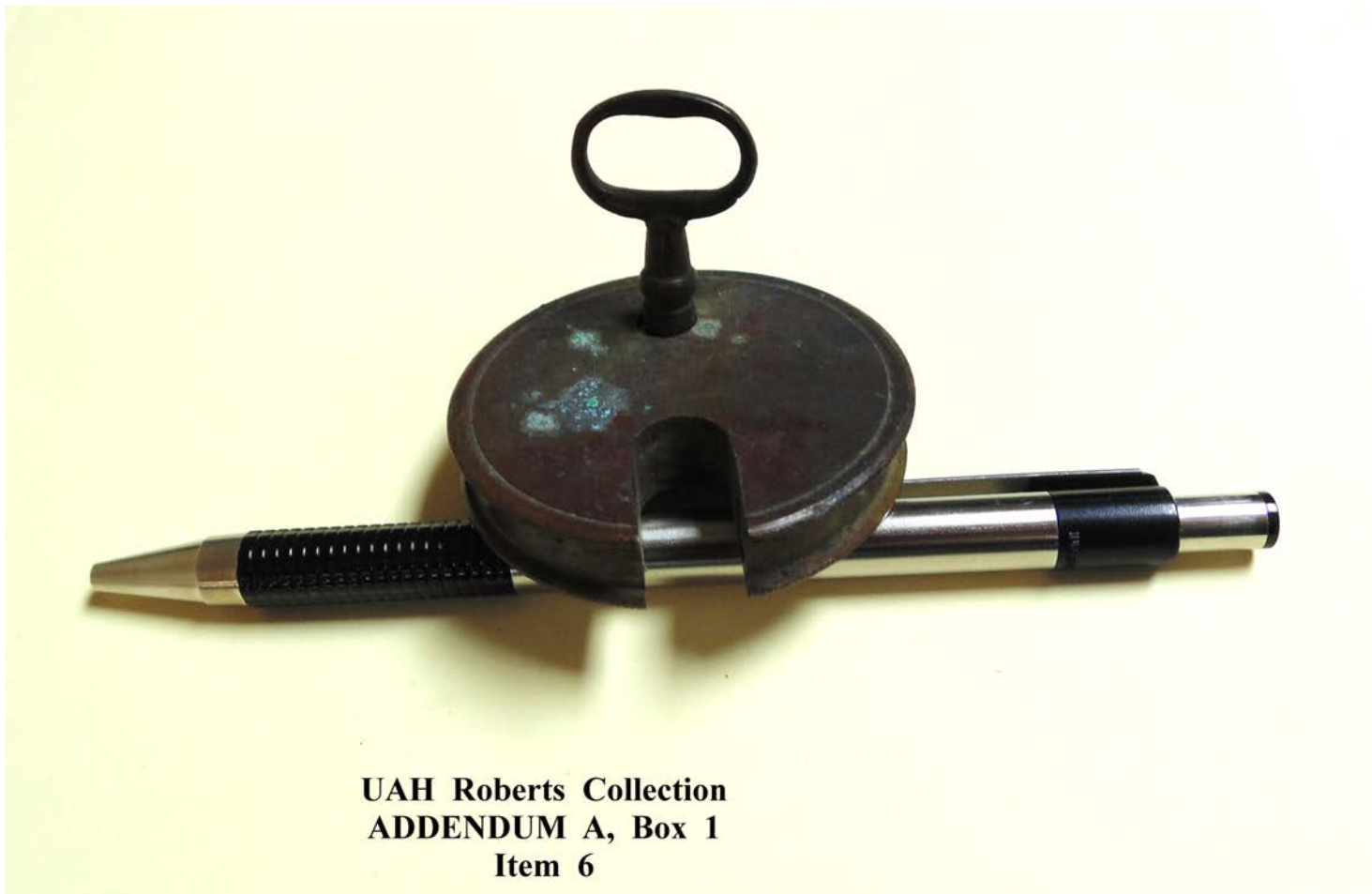
UAH Roberts Collection ADDENDUM A, Box 1 Item 6

Image 1 r13_01-00-006-4886 Contents Index About