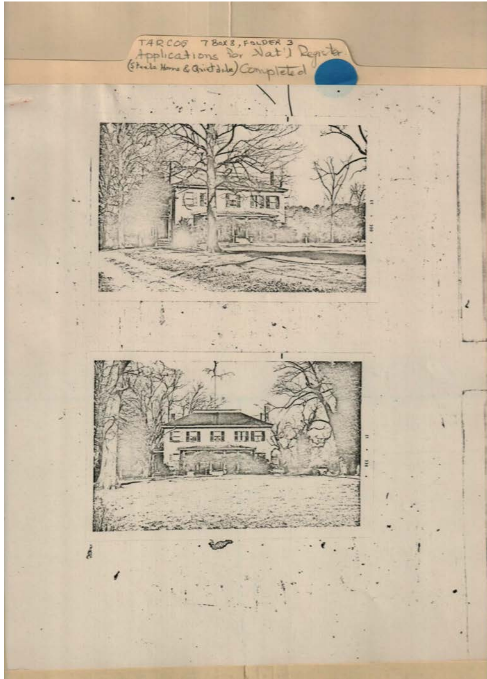
Names: Quietdale Types: photograph