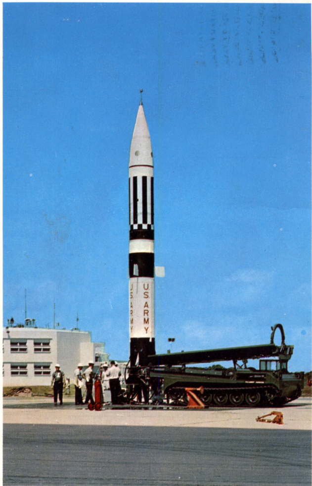
The Pershing Missile, Redstone Arsenal