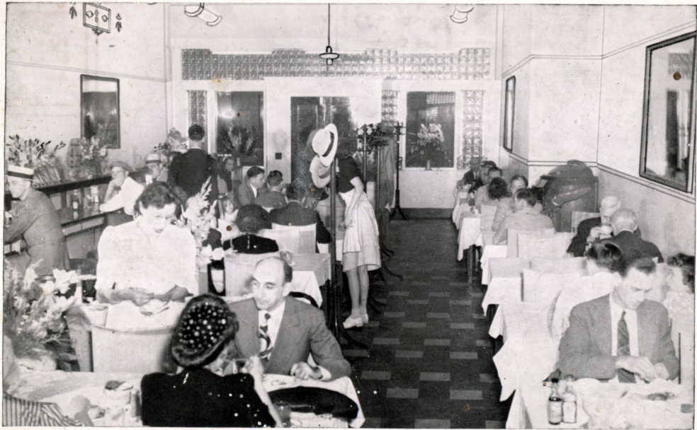
POST OFFICE CAFE, HUNTSVILLE, ALA.