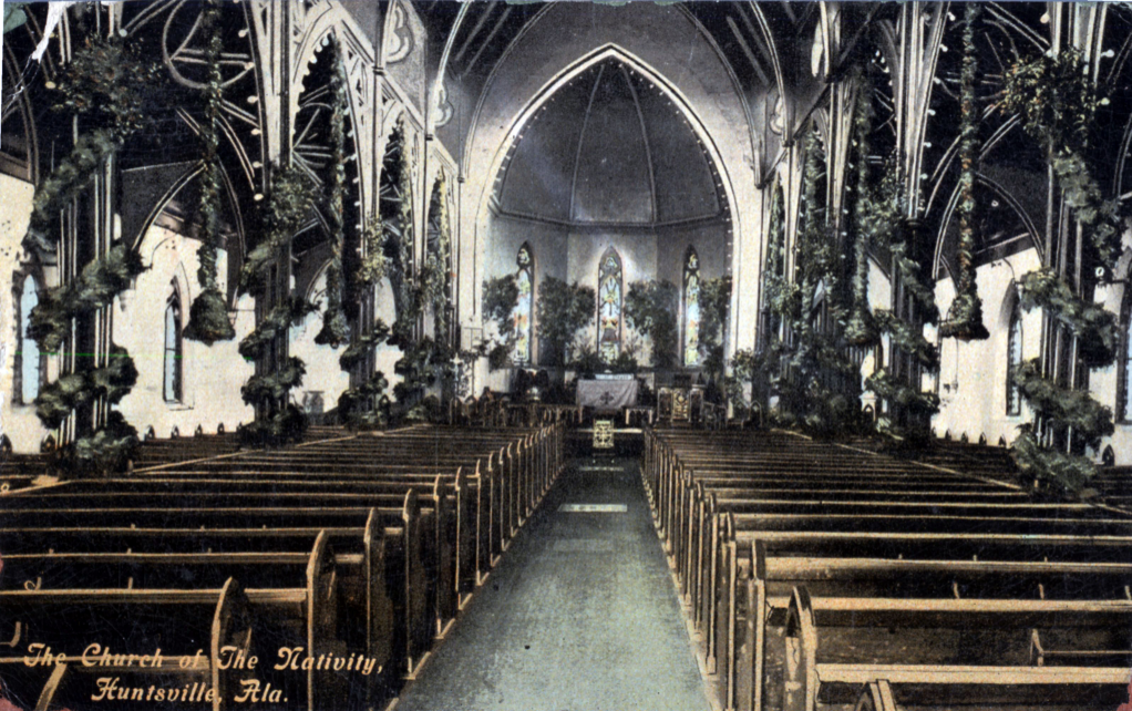
The Church of The Nativity, Huntsville, Ala.