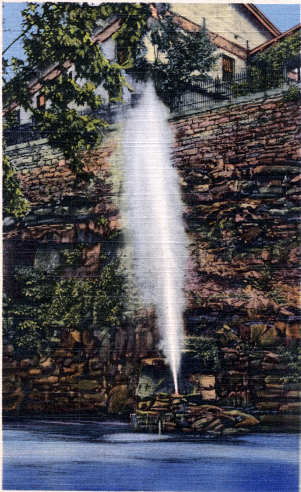
H-2—A CLOSE UP VIEW OF THE BIG SPRING, HUNTSVILLE, ALABAMA