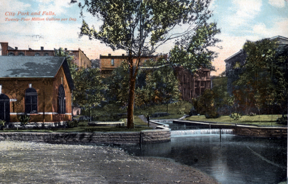
City Park and Falls, Twenty-Four Million Gallons per Day.