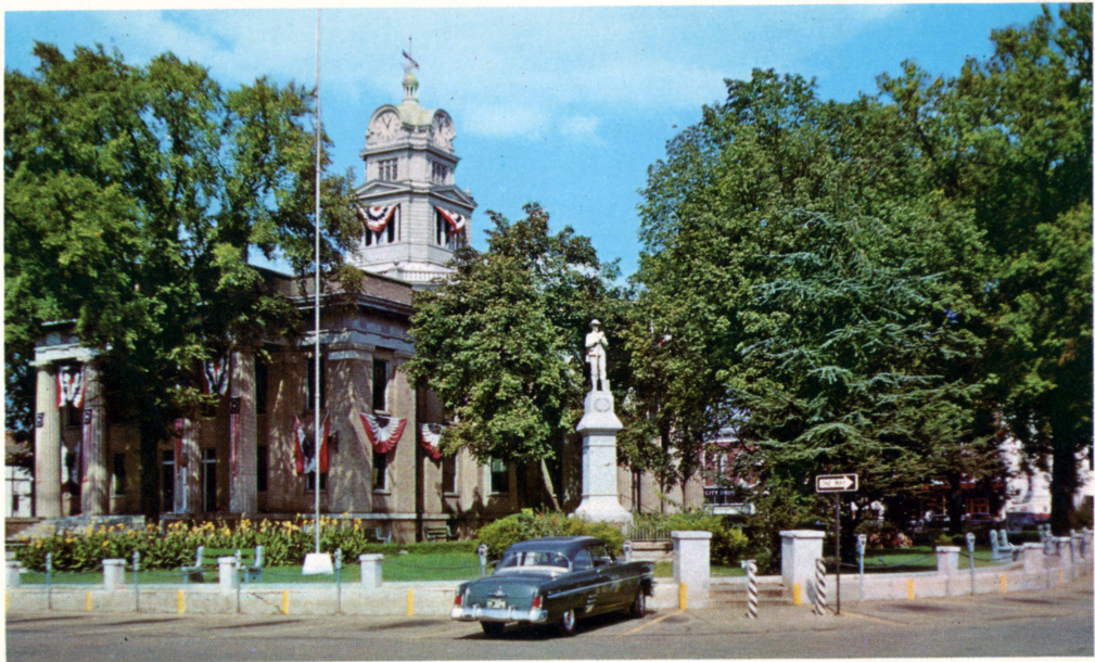
Courthouse, Huntsville, Alabama